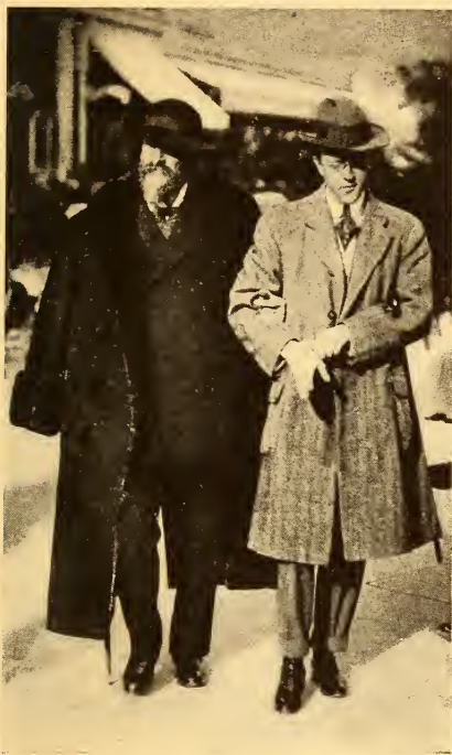
JOSEPH PULITZER AT MONTE CARLO, 1911